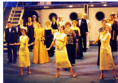
Anything Goes - 2006 York Light OPERA COMPANY LTD.