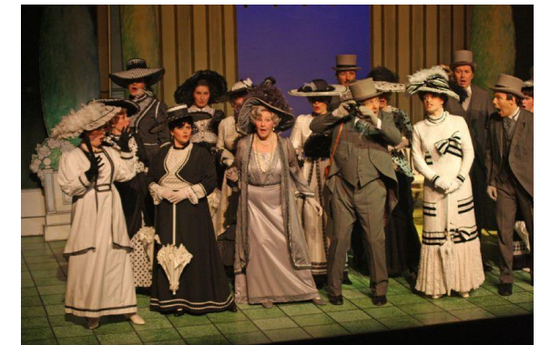
My Fair Lady - 2008