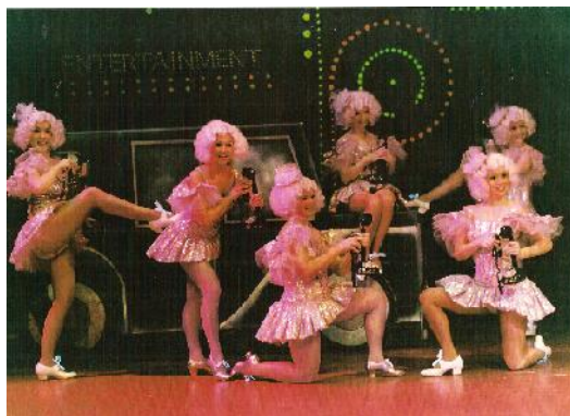
Crazy for You -1998