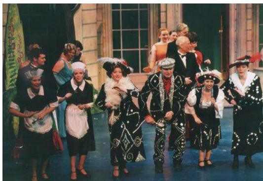
"Doing the Lambeth Walk" from Me and My Girl - 2003

As a Limited Liability Company we do not qualify for any external support or grants whatsoever, so we have to be entirely self-sufficient. That means we have to attract full houses to all our shows and to do so, apart from advertising in the media, we need a good network of Friends to spread the word and generally support the work of all the stalwart volunteers who make a show possible